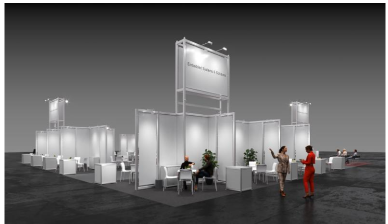
Your booth location

Top-Location in the attractive automation environment of hall 9