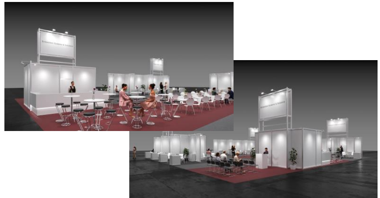
Lounge-Area & Speakers Corner