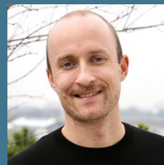
Ger Gerdes Woodworking Machinery

+49 69 6603 - 1377 dennis.bieselt@vdma.org